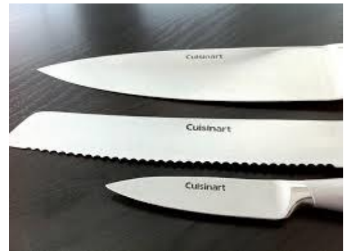
Top to bottom: Chef's knife, Bread knife, Paring knife

The secret to best results is keeping your knives very sharp either with a sharpening stone or have them sharpened at a trustworthy kitchen store.